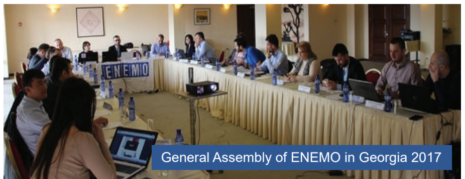
General Assembly of ENEMO in Georgia 2017

The next General Assembly of ENEMO will be held in the period from the 4th to 7th of October 2018, in Herceg Novi, Montenegro.